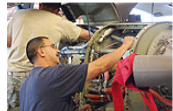
Expand Image The directorate of the T-6 maintenance division examines a T-6 Texan II parked at Laughlin Air Force Base.