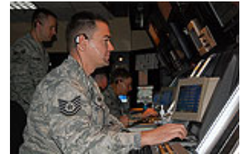
Expand Image A technical sergeant monitors air traffic at Laughlin Air Force Base.

It was renamed as Laughlin Field in November 1943 and later became Army Air Force Auxiliary Field, which was shut down in October 1945. Services resumed in